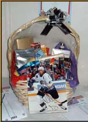
Some of the Gift baskets and ceramic plates (made by players) auctioned at the 2003 Monarchs "At Your Service" Fundraiser.