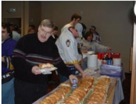
Look at the size of these sandwiches!!! Thanks to the Hartford Jesters for a great lunch.

The AHL Booster Club convention is scheduled for September 10,11,12 (week-end after Labor day) in Worcester this year. The final cutoff will be in late July with a small, non refundable deposit due in June. Prices and more information are available at the MMBC website as well as at www.ahlbcc.com .