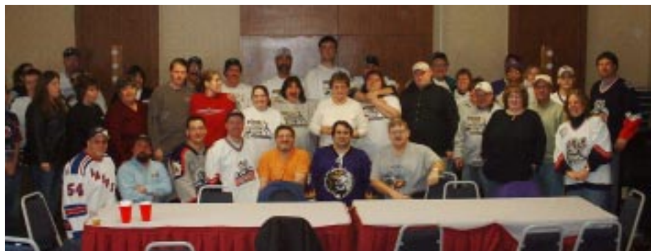
"Us" and "Them" when we visited Hartford, following our lunch of enormous deli sandwiches, chips, cheese puffs, drinks and desserts!